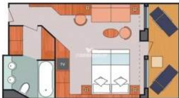
Floor Diagram Suite