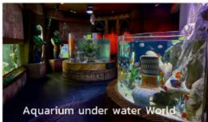
Aquarium under water World

Vinwonder Phu Quoc The most modern and largest amusement park in Vietnam, featuring over 100 types of attractions suitable for both children and adults. From gentle rides for small children to thrilling challenges for the adventurous, and for those who prefer not to indulge in rides, there are beautiful photo spots throughout the amusement park. Additionally, you can relax and enjoy the panoramic views of Phu Quoc Island from serene high vantage points.