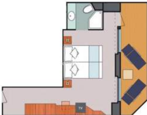
Floor Diagram Mini-Suite