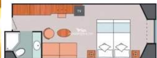
Floor Diagram Oceanview