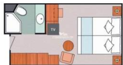
Floor Diagram Interior