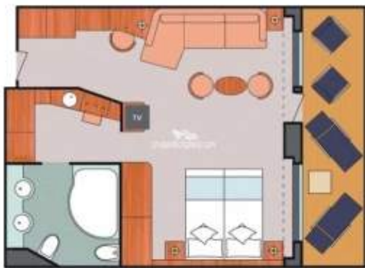
Floor Diagram Grand Suite